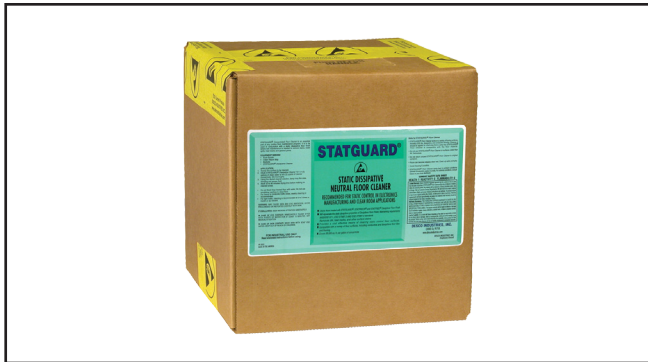
Figure 1. Statguard® Dissipative Neutral Floor Cleaner