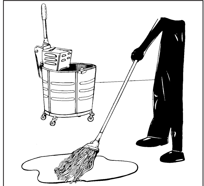
Figure 3. Applying the Statguard® Low Residue Floor Stripper with a cotton mop