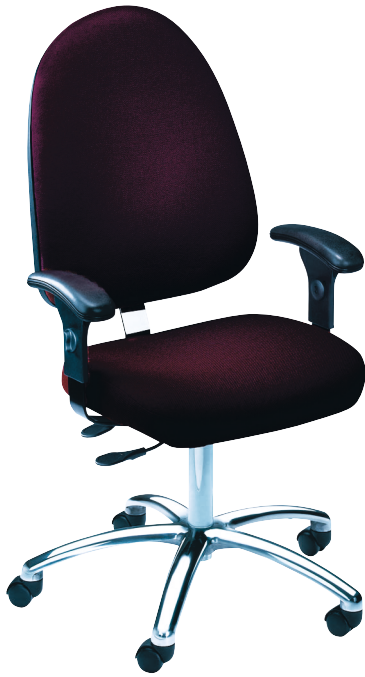
Model 9052X-S with optional arms and casters