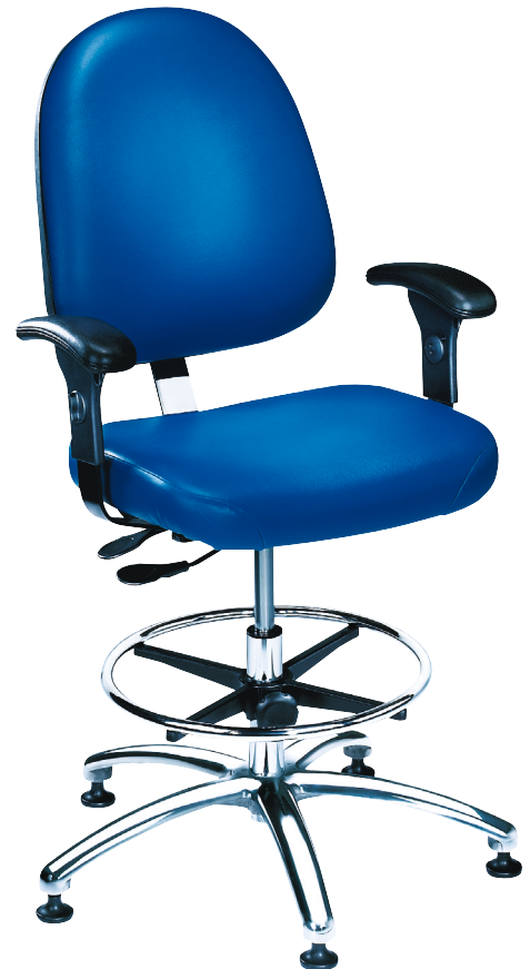
Model 9351L-S with optional arms and vinyl upholstery