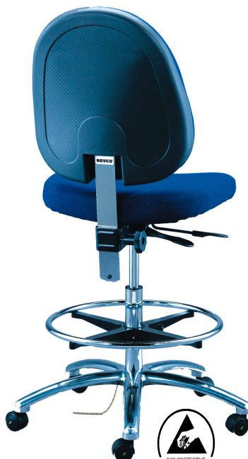
Model 9351L with optional ESD casters

BEVCO's reputation for outstanding value in ergonomic seating is backed by over 50 years of manufacturing. Made in the U.S.A., our products carry BEVCO's superior guarantee. It's not prorated, applies to a 24-hour day, and covers defects in material and workmanship for a full 12 years. Pneumatic cylinders are guaranteed for the lifetime of the chair.