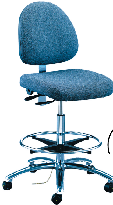
Model 9551M-E with optional ESD casters