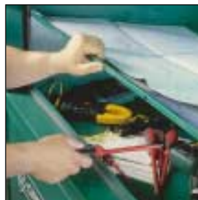
NEW – Slanted work surface with lockable, concealed storage area.