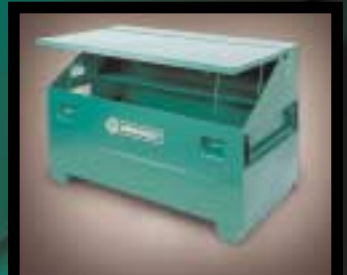
Slant-Top/Flat-Top Storage Boxes