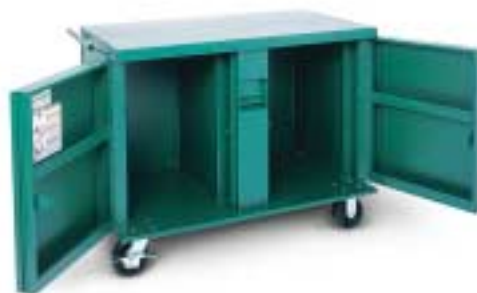
3848 – Shell only, add accessory shelves and drawers for your own custom workbench.