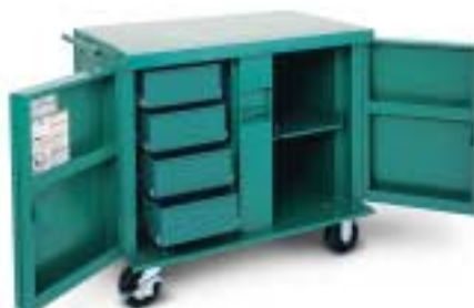
3842FD – Four 5-1/2" drawers, one shelf.