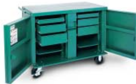
3848SD – Two 2-1/2" drawers, two 4-1/2" drawers, two 5-1/2" drawers, two shelves.