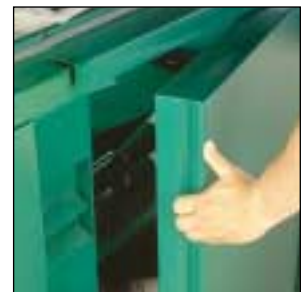
NEW – Grooved doors provide a comfortable, easy grip.