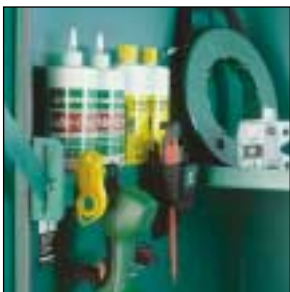
NEW – Sidewall storage compartments.