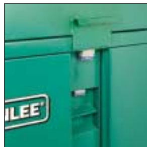
NEW – Recessed lock protectors (for upper and lower doors).