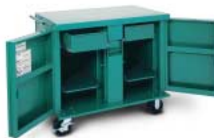
3842TD – Two 5-1/2" drawers, two shelves.