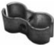
POST CLAMP Cat. No. 9994Z