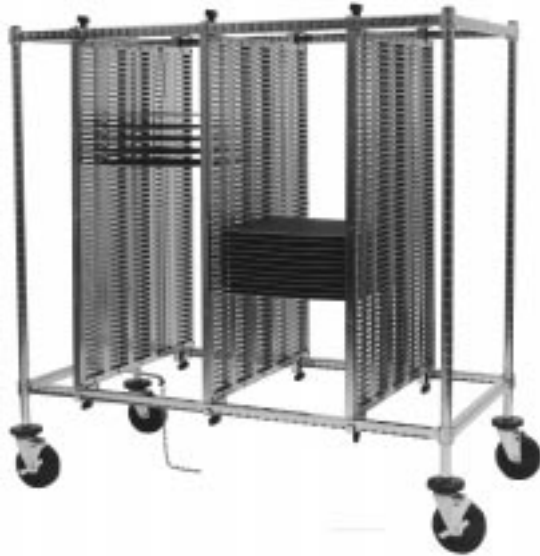
Benchside Model with Optional Center Panel