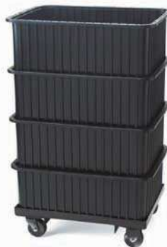
DC3060 on ESD-Safe DDC3000-CON Dolly

Available Stocked Color: ● XL Conductive Includes drag chain.