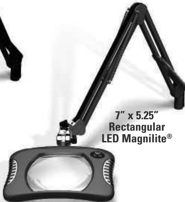
82400-4 (Shown in optional Blaze Red finish)