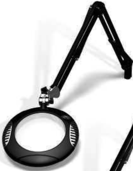
62400-4-B (Shown in Carbon Black)