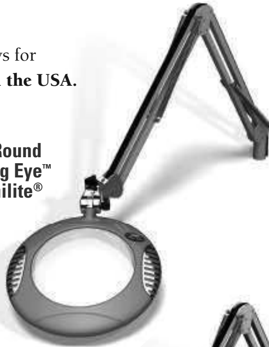
62400-4 (Shown in optional Brilliant Orange finish)