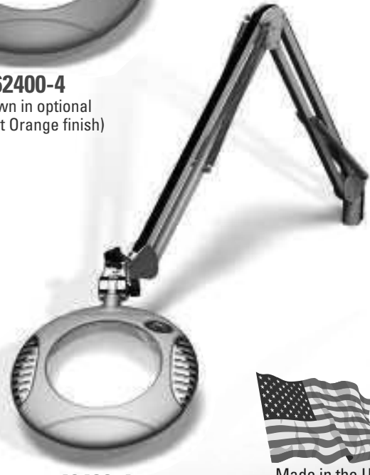
42400-4 (Shown in Shadow White)