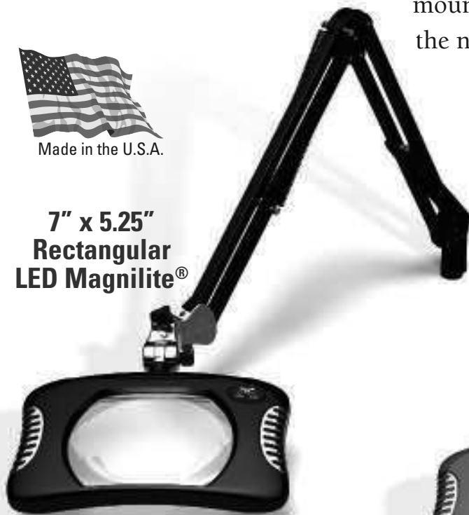
82400-4-B (Shown in Carbon Black)