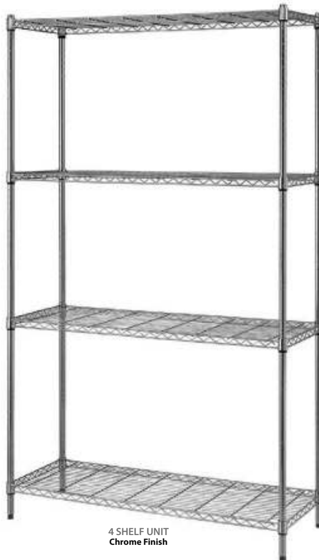
4 SHELF UNIT Chrome Finish