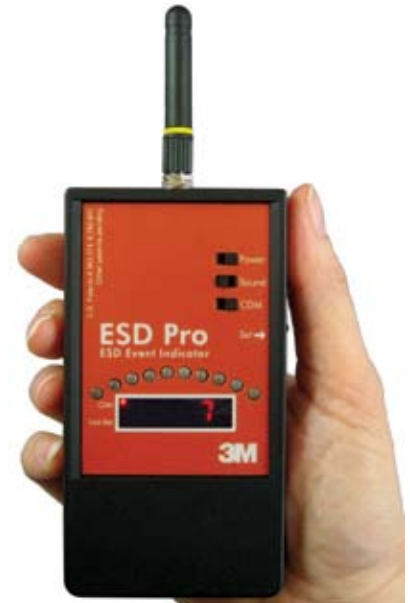
3M™ ESD Pro Event Detector, CTM082

Applications for the ESD Pro include electronics assembly, semiconductor device manufacturing, disk drive manufacturing, medical environments and military aerospace.