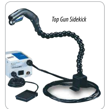
Top Gun Sidekick

The Top Gun with Sidekick offers hands-free operation and flexible positioning during assembly and manufacturing processes. A foot pedal controls both ionization and airflow, which reduces compressed air costs and extends the life of the ionizer. The flexible gun mount allows the operator to focus the ionized airflow where it is needed. The stand includes a steel bracket for easy bench-top mounting.