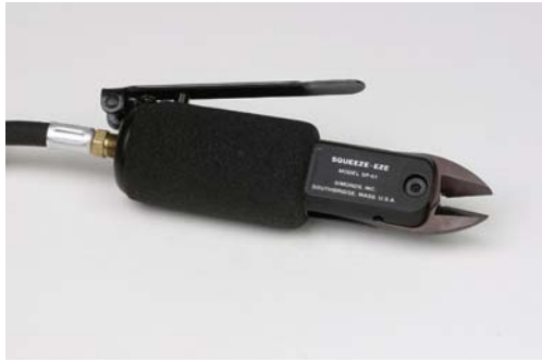
SP-01P with Optional Jaw