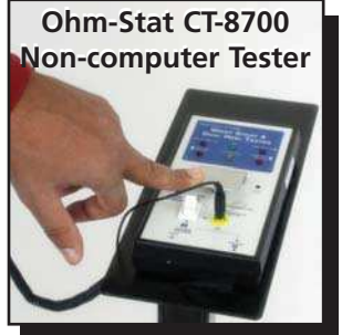
Adjustable limits. Test each foot and wrist individually and simultaneously

When used with a computer and leading edge software the employee's test results are stored in the computer and then can be emailed to supervisors. NO MORE LOG BOOKS. These reports and data can help conform your company to EDS 20/20 specifications or ISO standards. Speed up testing, and eliminate no tests.