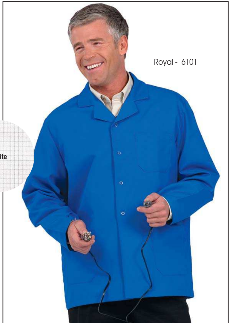
Royal - 6101