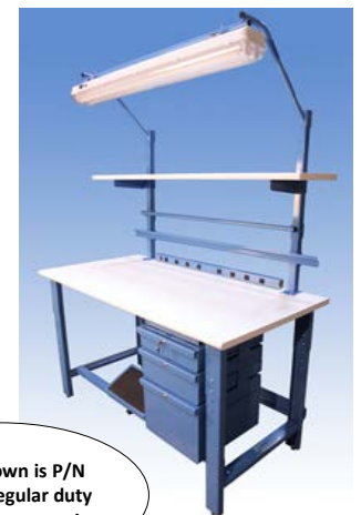
Bench shown is P/N 180-150, regular duty bench with accessories