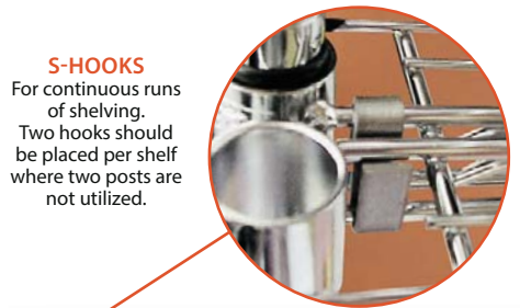
S-HOOKS For continuous runs of shelving. Two hooks should be placed per shelf where two posts are not utilized.