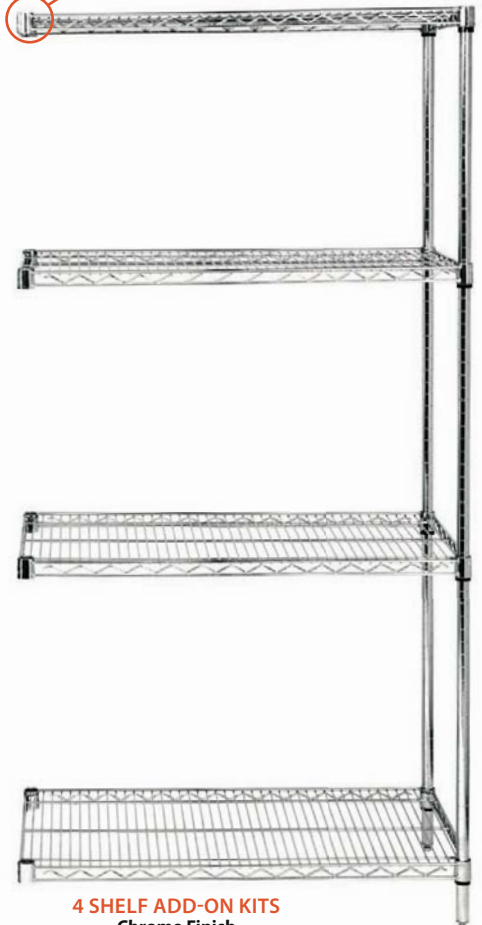
4 SHELF ADD-ON KITS Chrome Finish