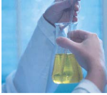
Cleaning, degassing and dispersing in the lab

Ultrasonic cleaning units with specific features for different business sectors