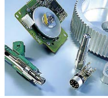
Parts cleaning in industry, workshops and service