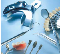
Cleaning in the dental and medical sectors*