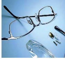
Cleaning of optics and ophthalmology