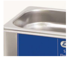
Filling level marking