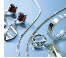
Cleaning in the jewellery branch