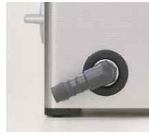
Adjustable drain duct