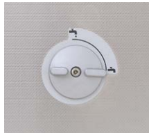
Knob for drain on side

The Elmasonic S units are available in 16 different sizes, ranging from 0.5 up to 90 litres. They are equipped with efficient 37 kHz ultrasonic high-performance transducers of the latest generation.