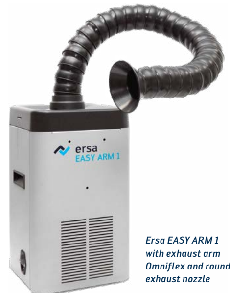
Ersa EASY ARM 1 with exhaust arm Omniflex and round exhaust nozzle

For energy saving purposes and to extend filter lifetime, both units can be connected with Ersa i-CON soldering stations or a standby switch. In this way, the extraction unit is only working whilst the attached soldering station is in operation, stopping as soon as the soldering station goes into standby mode.