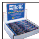
Pop-Up Cardboard Display Carton

per shipper carton. Display cartons are also sold separately for refillable, point-of-purchase display. 3.5" sticks are also available in blister packs (12 per carton); printer minimum applies. Contact Sales for acrylic display rack supplier information.