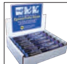
Pop-Up Cardboard Display Carton

FastSteel is available in 3.5" (2 oz) and 7" (4 oz) lengths, individually packaged in a reusable clear plastic tube with trilingual (English, Spanish, French) instructions and plastic friction top. The display carton holds 12 or 24 - 3.5" sticks or 12 - 7" sticks (packed 2 display cartons per master carton), or bulk-packed 24 sticks per shipper carton. Display cartons are also sold separately for refillable, point-of-purchase display. 3.5" sticks are also available in blister packs (12 per carton); printer minimum applies. Contact Sales for acrylic display rack supplier information.