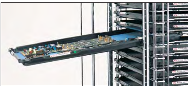
SmartTray<sup>™</sup> engages with wire cart design to provide optimum ergonomic access.