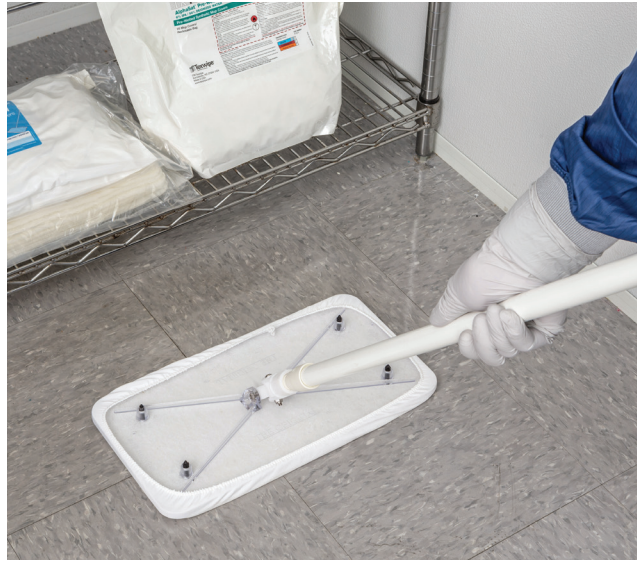
AlphaMop™ 100% Polyester Cover and Pad