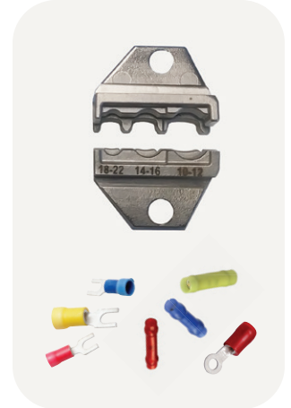
2210NV221 #22 - 10 AWG Nylon and Vinyl Terminals/Splices