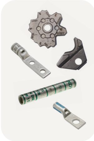
81WHL221 #8 - 1 AWG Terminals/Splices