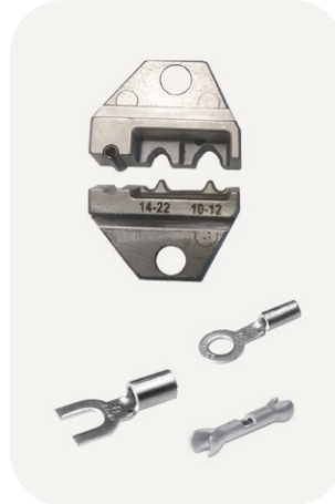
2210B221 #22 - 10 AWG Bare Terminals/ Splices