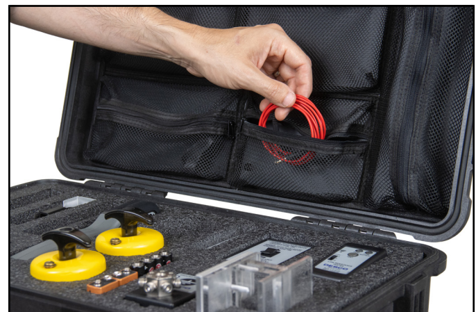
Figure 2. Using the ESD Survey Kit's lid organizer

The ESD Program Standard ANSI/ESD S20.20 can be downloaded here: https://www.esda.org/standards/