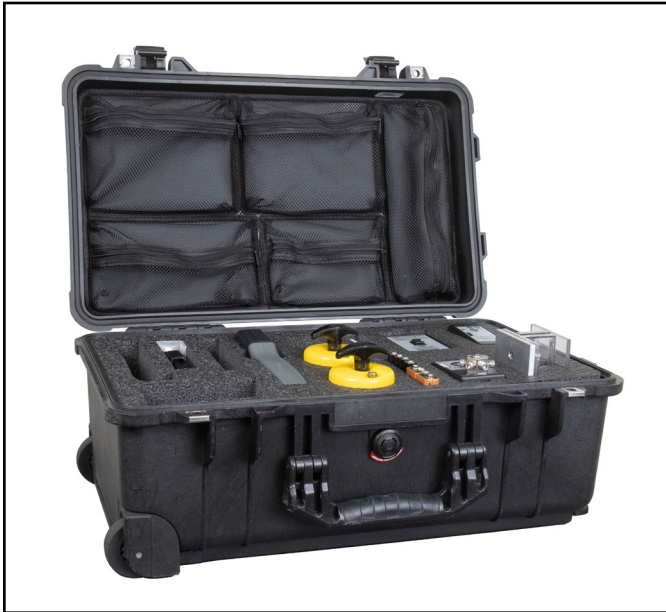
Figure 1. Desco 19791 ESD Survey Kit