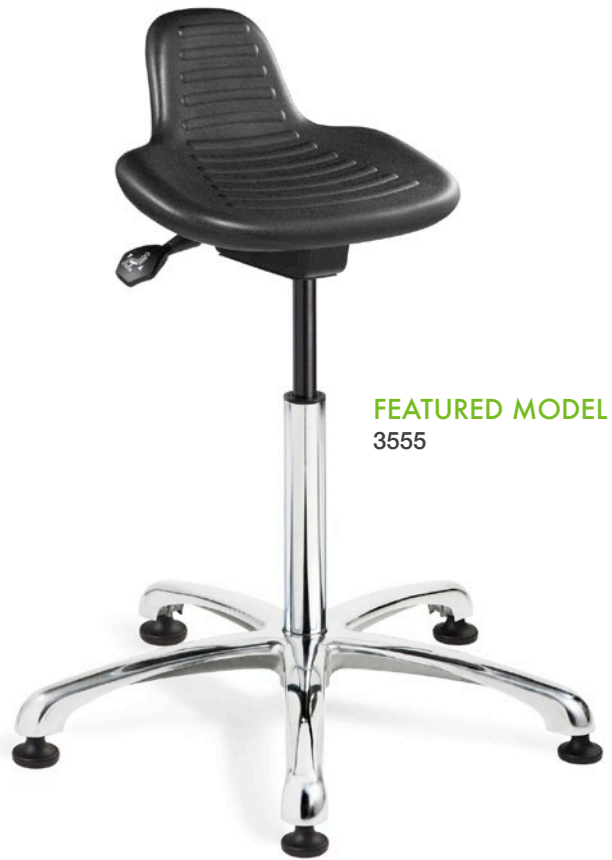
FEATURED MODEL 3555