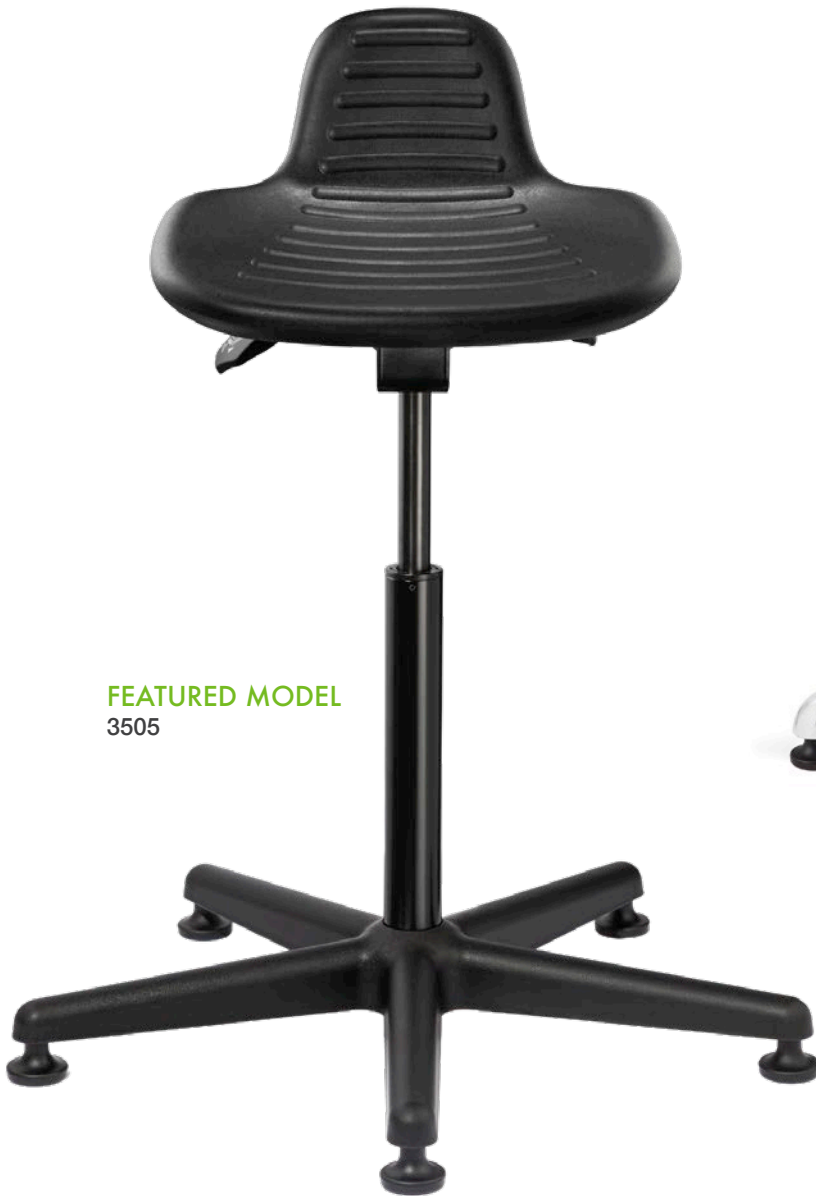
FEATURED MODEL 3505